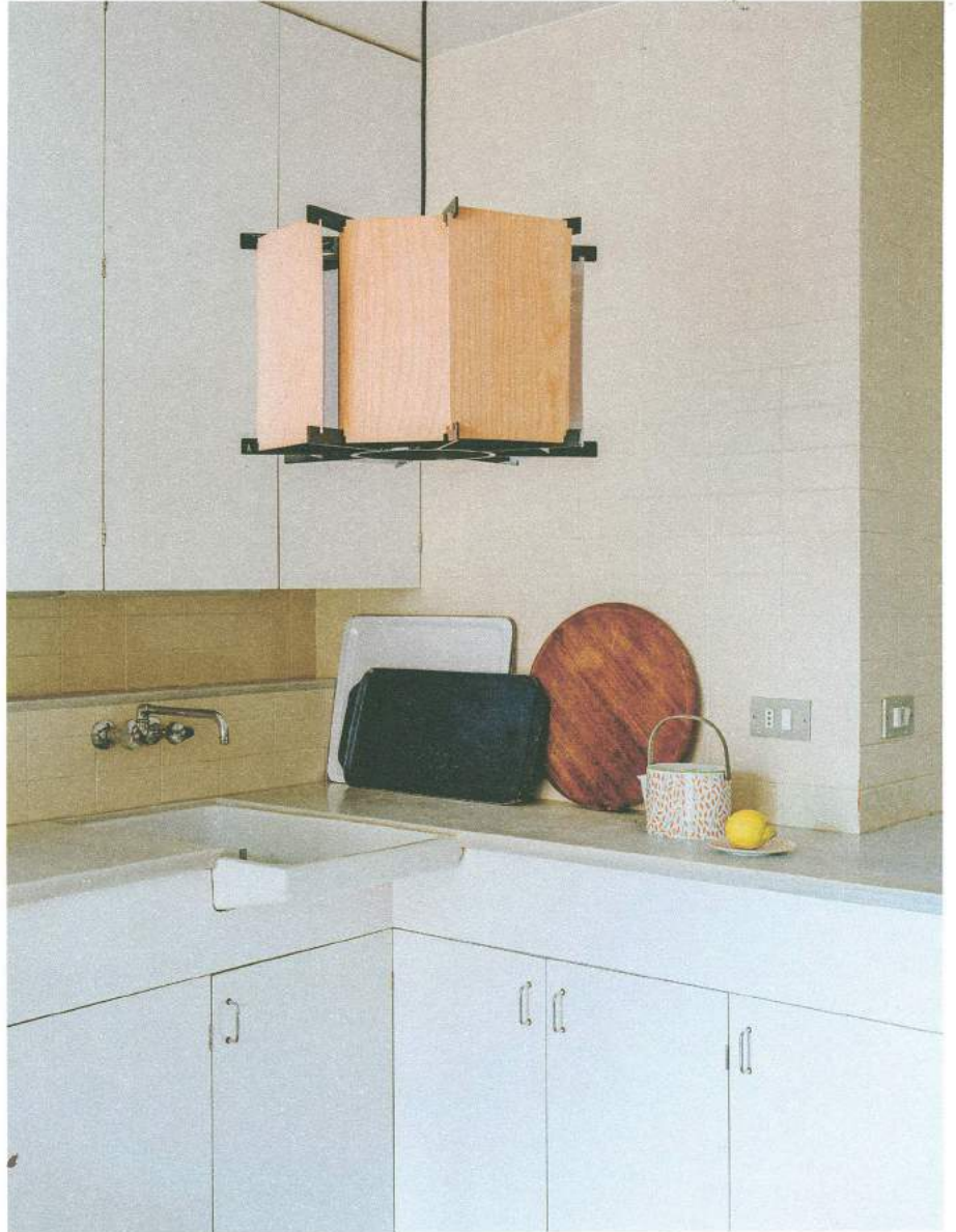
A WALK IN THE GARDEN teapot and plate by HERMÈS MVV lamp by MANUEL VALLS VERGÉS for MARSET