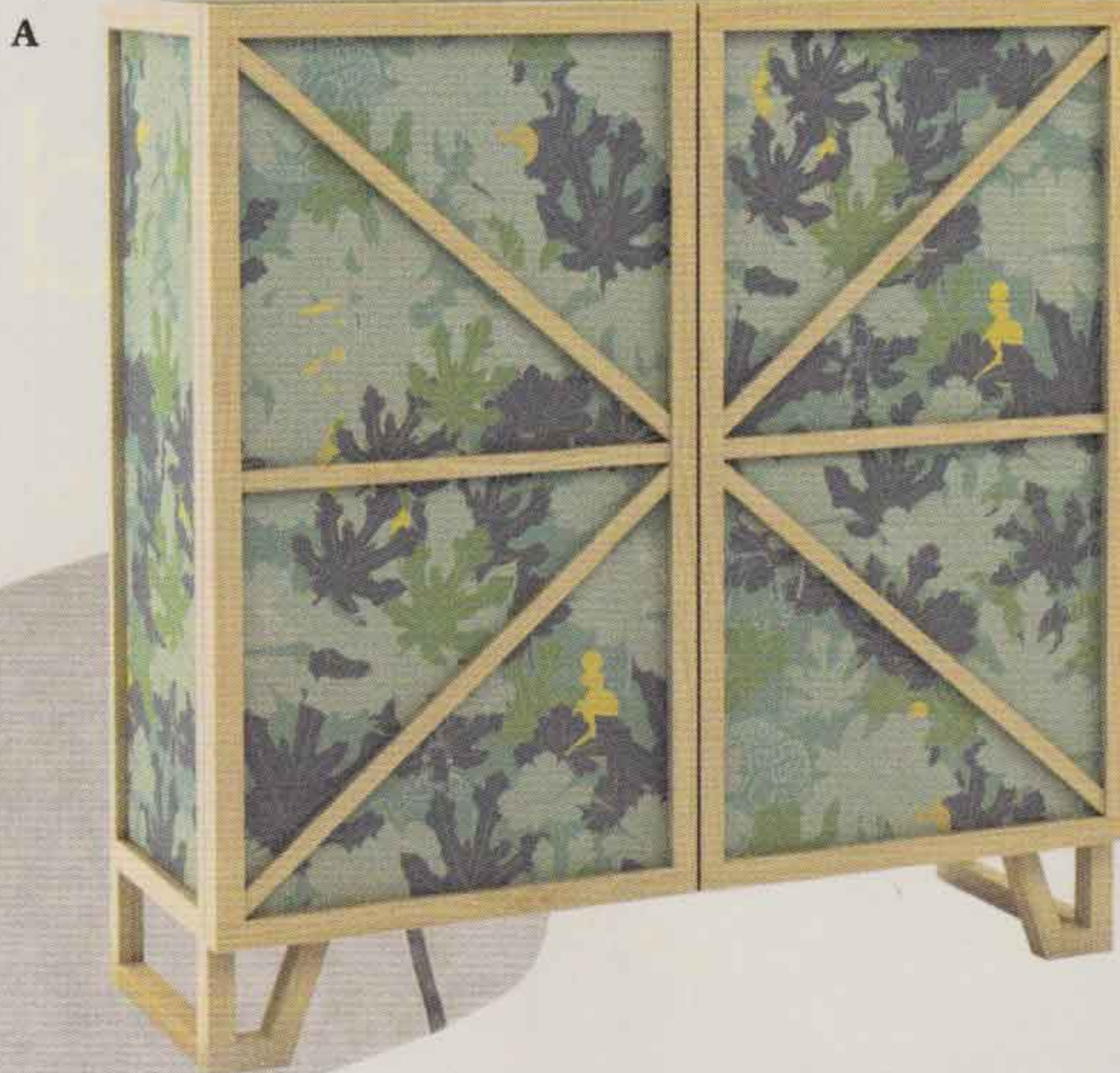
A Tudor Low cupboard by Joost & Kiki for Moooi, $5,150 An ash frame holds fabric panels printed with a botanic pattern reminiscent of Henri Rousseau's paintings. Available in blue, red, and green (shown). moooi.com