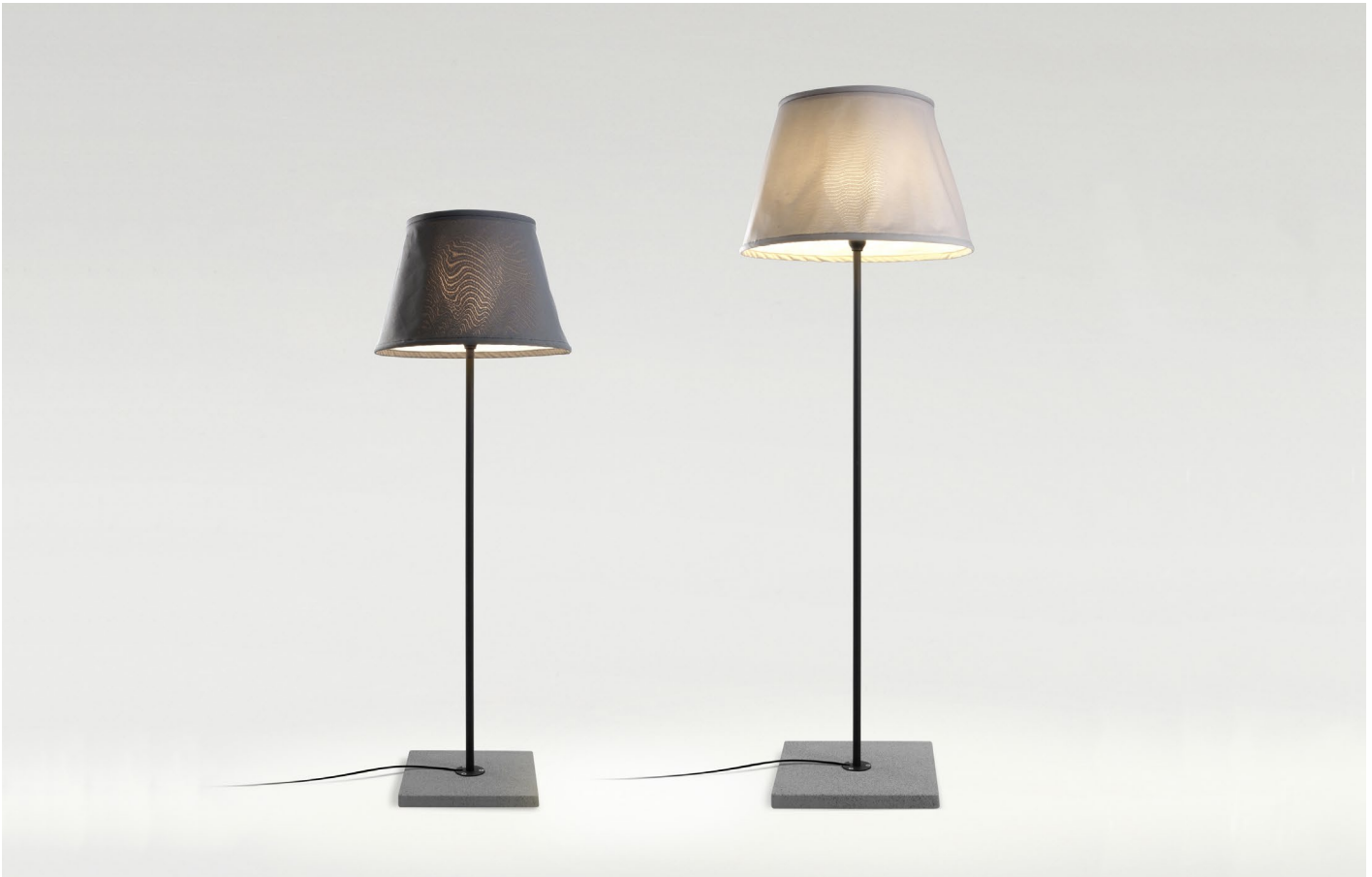
TXL 2019 205