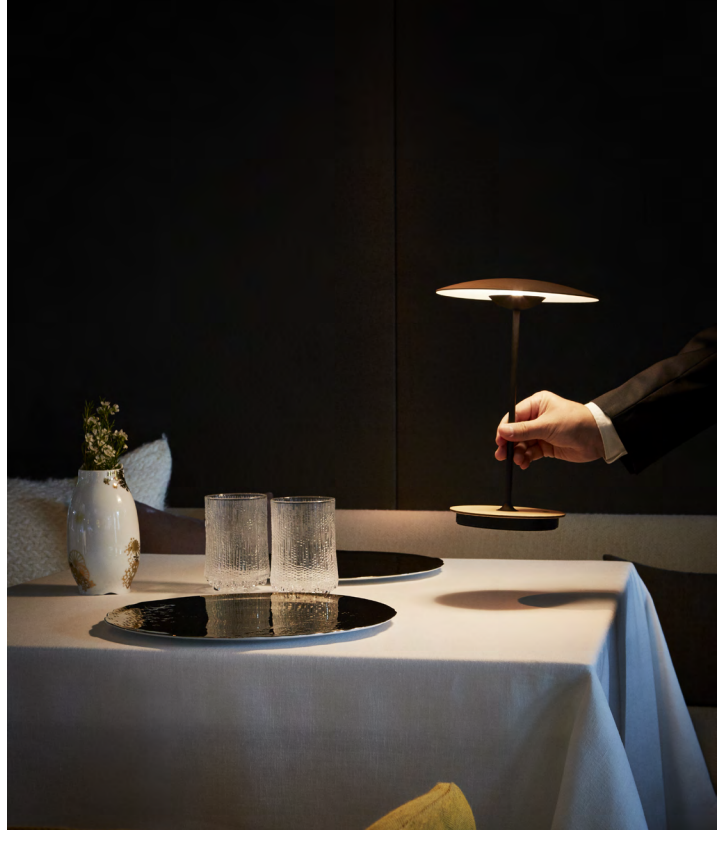
LED-Ginger 20 M